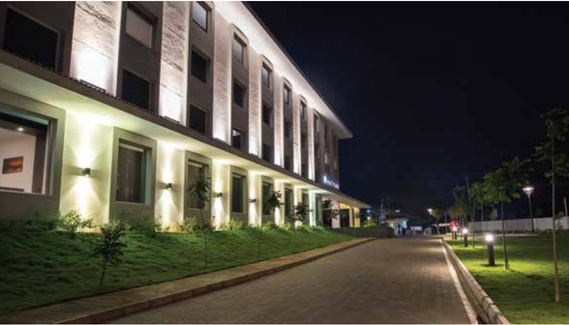
HYATT PLACE, RAMESWARAM